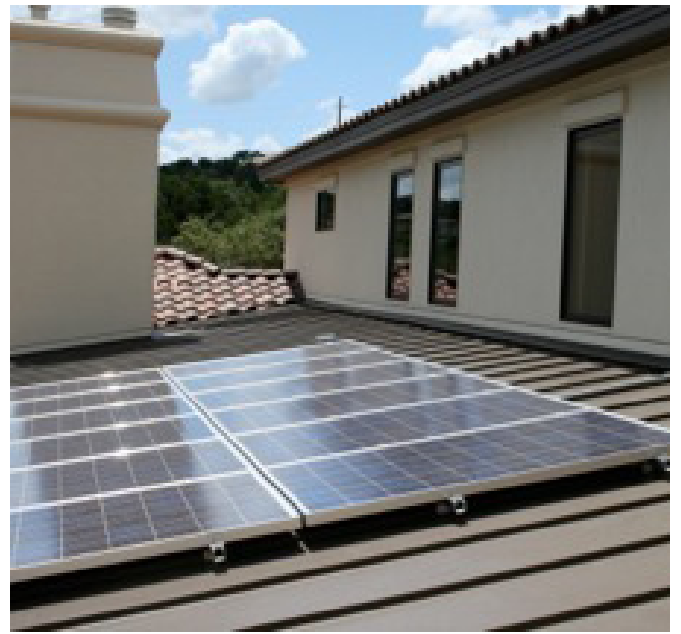
Solar looks great on Texas rooftops.

been slow to catch on to the fact that they can profit from sustainable energy. “The future is in clean energy,” Hadden says, adding that the sooner they make the switch, the better off they will be economically. “Several years ago we were actually at a point in time where there were 22 coal plants proposed in our state. It was extremely excessive and would have generated way more energy than we needed.”