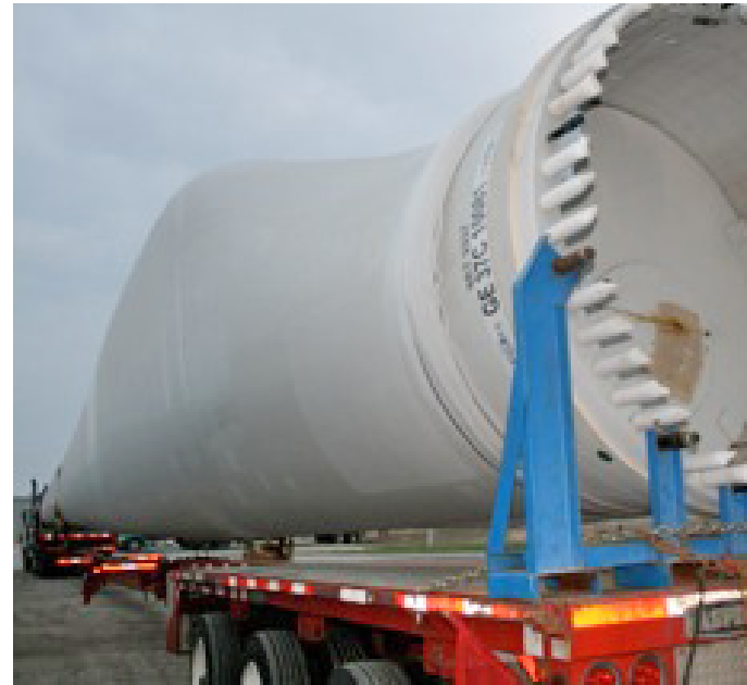
Wind turbine blades being transported to West Texas

sion they don't see eye-to-eye with the government on some issues, generally they've earned a lot of respect and goodwill with legislators at different levels, Hadden says. Typically, they will provide input to legislative and testimonial bodies when it comes to key issues.